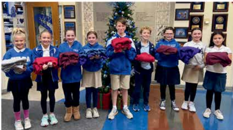
VMA Elementary students collected money for sweatshirts and pants.

With our combined funds we were able to send 75 sets of sweatshirts and pants to the Shelter. When we asked them if they could use them, they enthusiastically assured us they would be so helpful to their clients this winter.