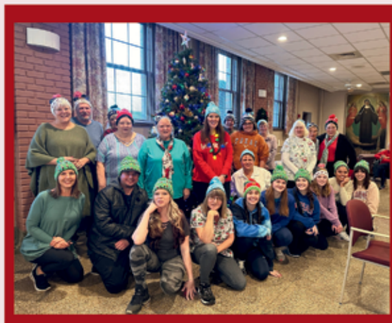
St. Walburg employee Christmas party.

Dec. 20: LED winter beanies lit up each employee at the annual Christmas party.