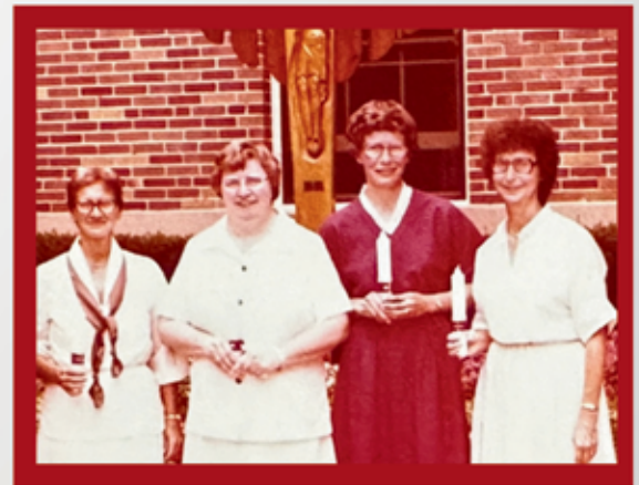
Silver Jubilee in 1979