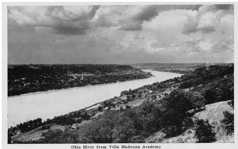
Ohio River from Villa Madonna Academy